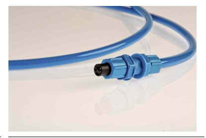
Option 2: For injection hoses under pressure: SPL W Lock Connection Cap 6mm (Art. 111994):