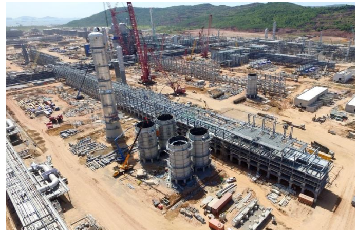
Zone 1 & 2_Process Area