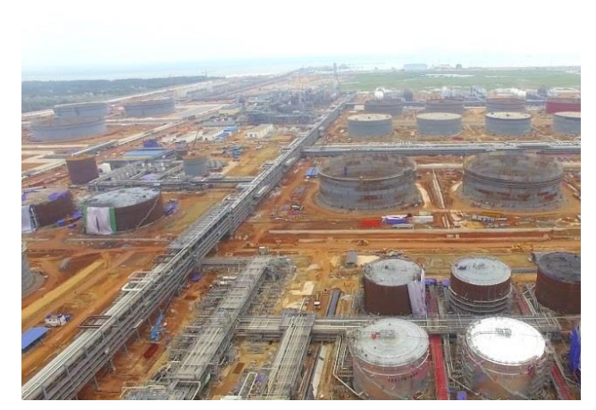
Zone 3_Tank Farm