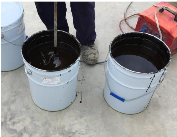
Stirring material before application

The finished membrane should be protected from damage by other trades.