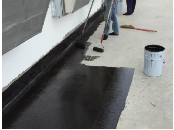
Application of primer, 1 st coat and 2 nd coat Sikalastic®-680 AP by brush or roller