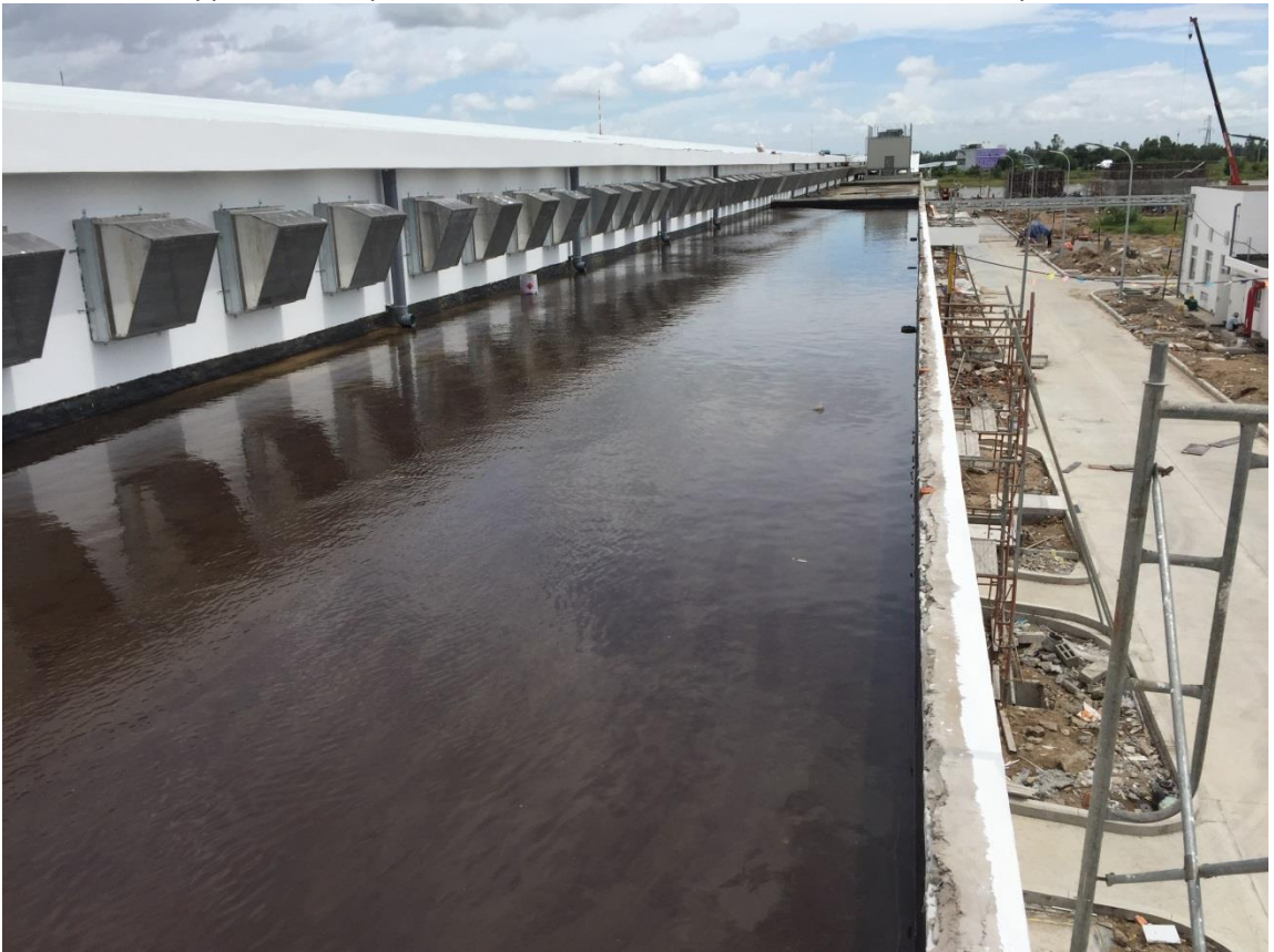
Ponding test before application of protection layer