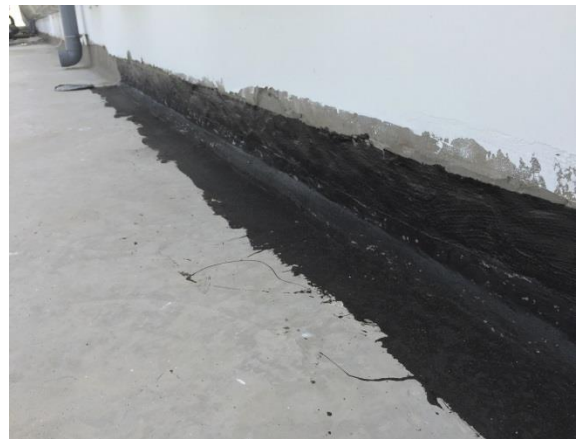
Application at detail areas first (corner, up-stand, etc.)