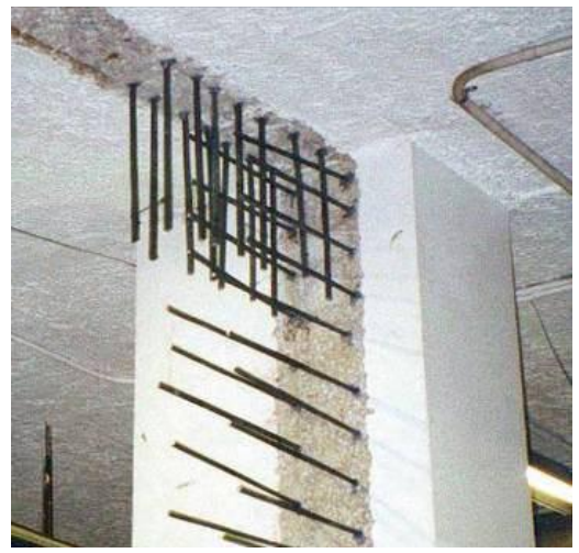
(Would you please contact our technical department in case of any questions)