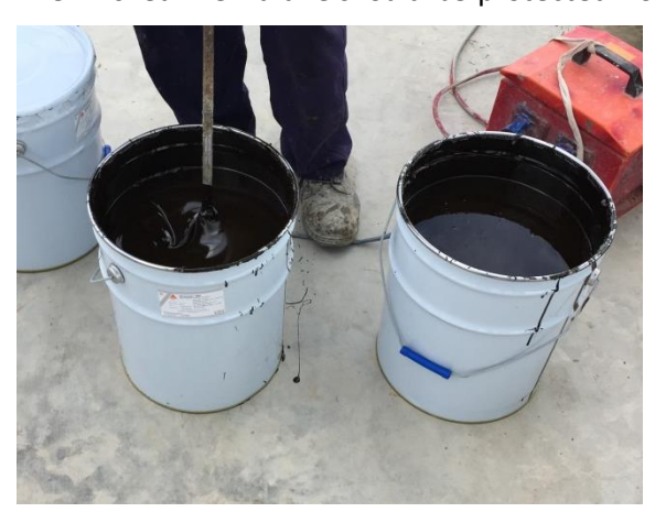
Stirring material before application

The finished membrane should be protected from damage by other trades.