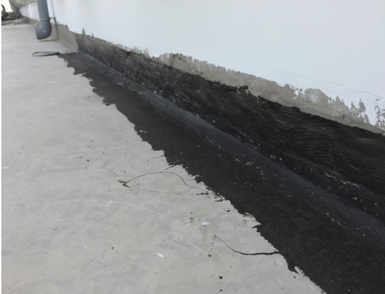
Application at detail areas first (corner, upstand, etc.)