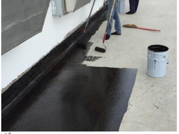
Application of primer, 1<sup>st</sup> coat and 2<sup>nd</sup> coat Sikalastic®-680 AP by brush or roller