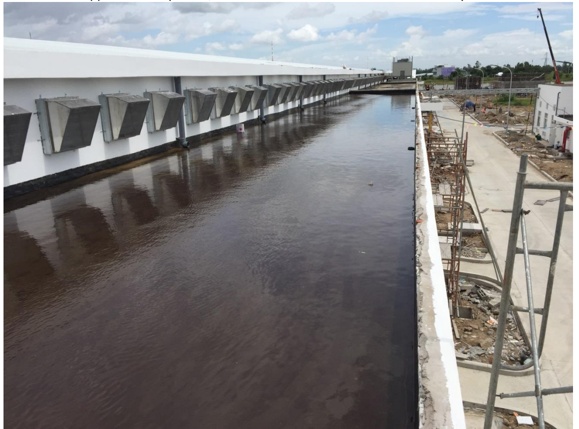
Ponding test before application of protection layer