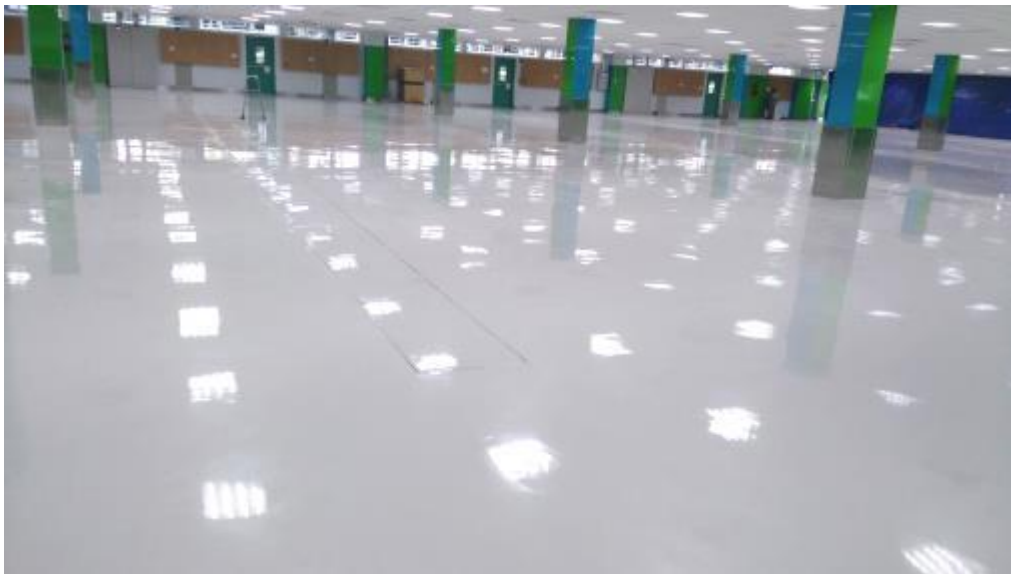
Picture: Sikafloor 263 SL /264 HC