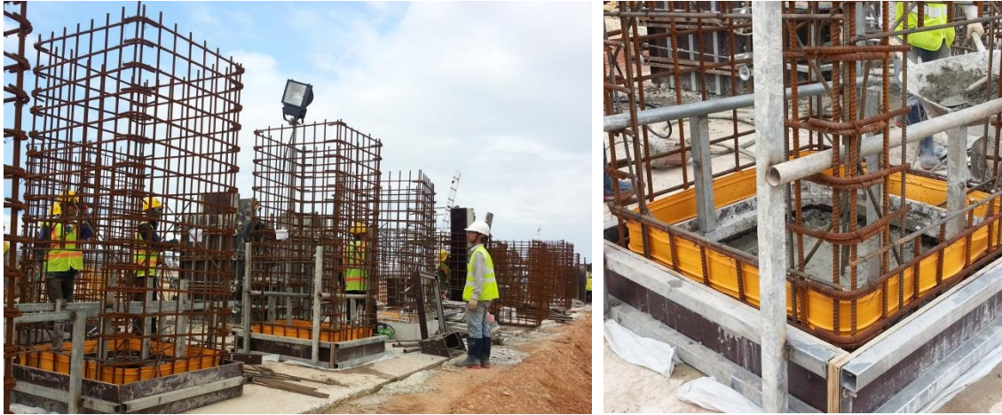
Picture: Sika waterbar