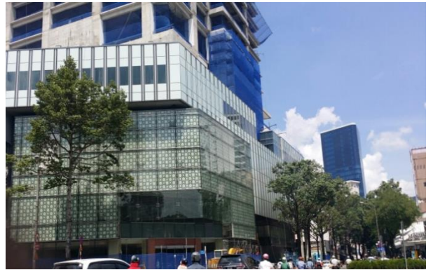
Picture: The retail mall of Saigon Center phase 2

Keppel Land đã tiếp tục triển khai giai đoạn 2 của dự án Sai Gon Center với 43 tầng cao và 7 tầng thương mại trải rộng trên diện tích 50.000 mét vuông, bao gồm một siêu thị 5 tầng rộng 15.000 mét vuông. Trung tâm thương mại đã đi vào hoạt động vào tháng 8 năm 2016.