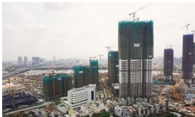
Vinhomes Central Park general view