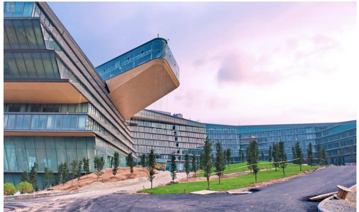
Picture: JW Marriott hotel was on construction