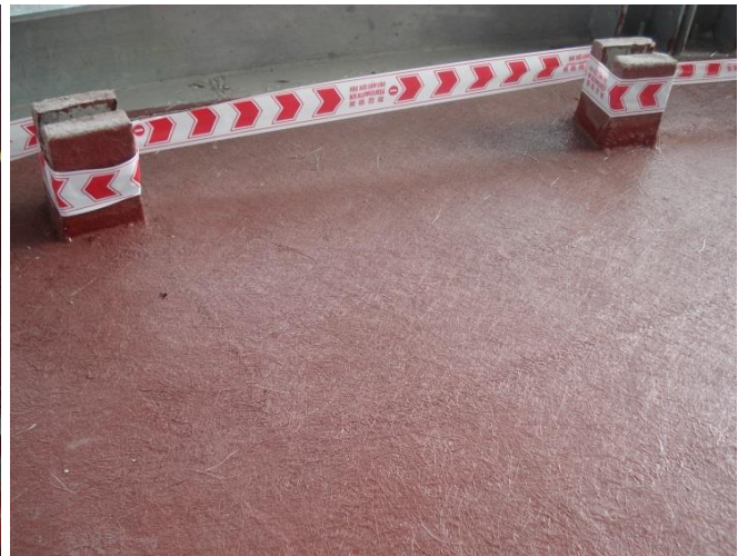
Picture: Felt and Sikalastic®-560 was supplied for Bitexco Financial project