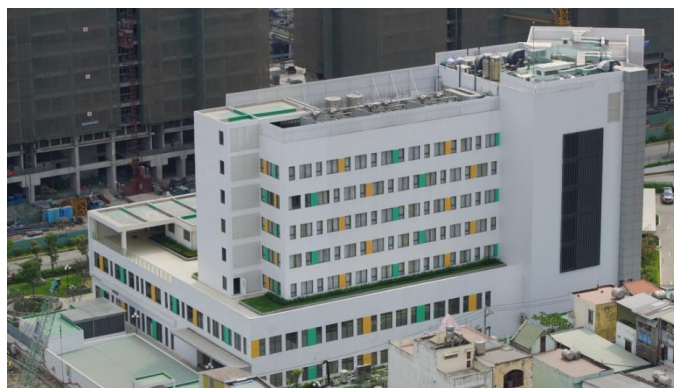
Picture: Villas area and Vinmec hospital in the Vinhomes Central Park project